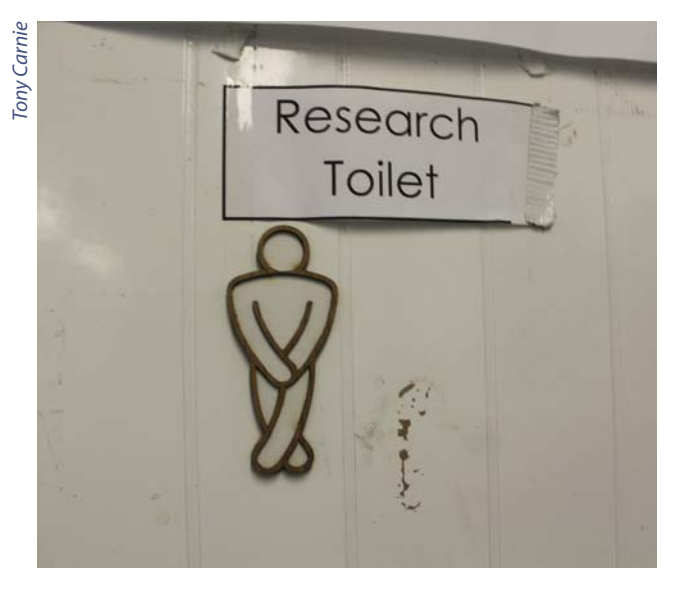
The entrance to the PRG research toilet.

and irrigate (fertigate) farm crops. The wastewater first passes through an anaerobic baffled reactor and associated anaerobic filters and then through a constructed wetland before the final treated water is used to fertigate a variety of crops such as bananas, rice, sorghum or taro (madumbe).