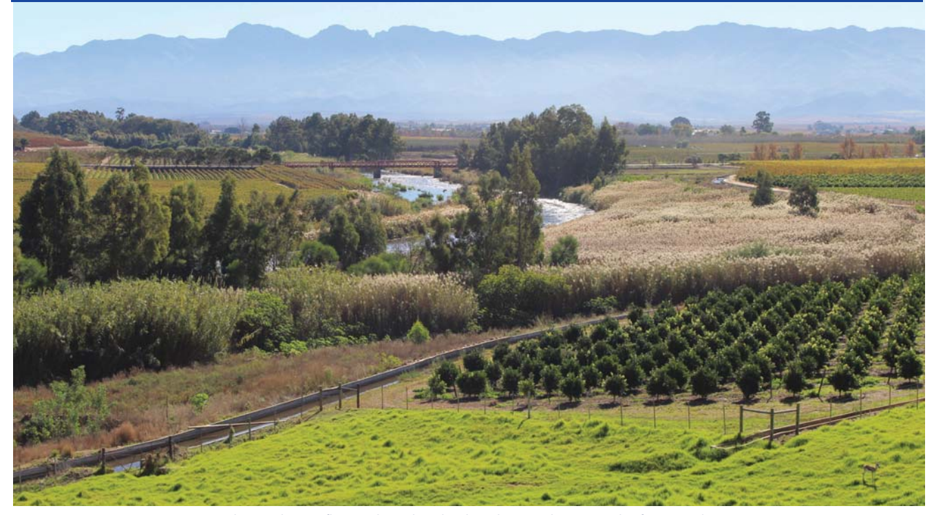
The Breede River flowing through orchards and vineyards just outside of Bonnievale.