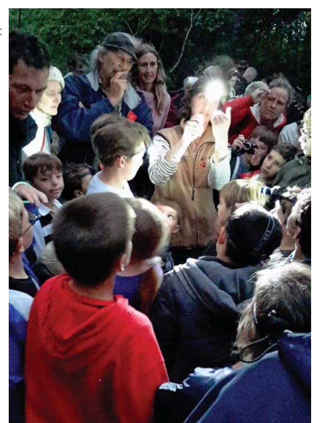
Education plays an important role in the conservation of South Africa's frog species

Globally, this resource is literally trillions of dollar worth, and we get it for free," notes Tarrant.