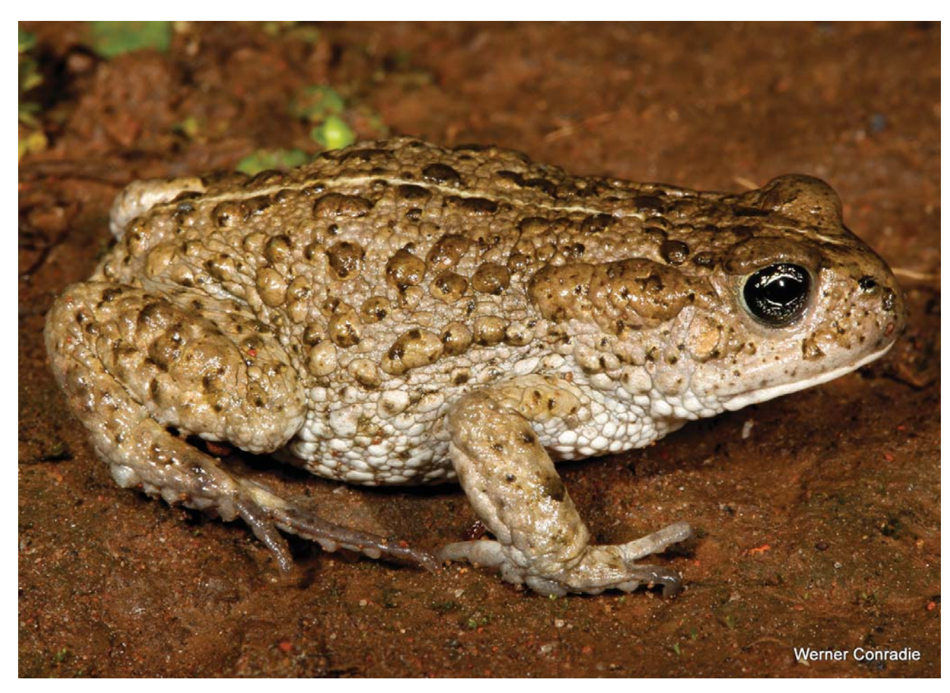
Almost 30% of South Africa's 135 frogs are considered threatened.

At this stage, the distribution of the newly described moonlight mountain toadlet is not well understood. "Given the vulnerability of these species and their limited range, targeted efforts and effective management of key conservation sites will benefit