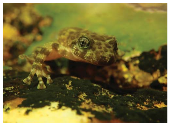
A Table Mountain Ghost Frog tadpole (left) and an adult (right). This rare and elusive frog species is endemic to Table Mountain in the Western Cape

all three species," Tarrant says. "Frogs are generally sensitive creatures. Some are generalists and can tolerate a wide range of environmental variables, including temperature changes."