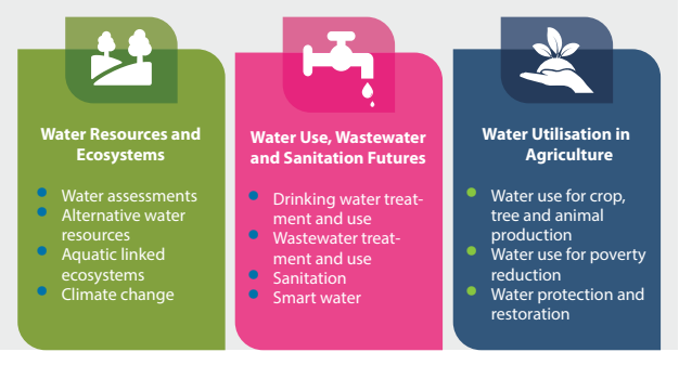
The three main research and development areas of the WRC.

The three business divisions in the Research and Development branch of the WRC