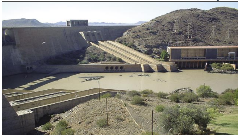
The Gariep Dam is also used for hydropower.

In addition, there are two pumped storage schemes at present. The Drakensberg Pumped Storage Scheme not only supplies the country with 1 000 MW of electricity during peak periods, it also assists in supplementing the Vaal Dam with water transferred from the Tugela River in KwaZulu-Natal. Completed in 1988, the 400 MW Palmiet Pumped Storage Scheme is situated about 50 km from Cape Town. This scheme is also used to pump water from the Palmiet River catchment into the Steenbras Dam to supplement Cape Town's water supply. At present, Eskom is also developing a third pumped storage scheme at Braamhoek, in the Klein Drakensberg (for more details, see the article elsewhere in this issue).