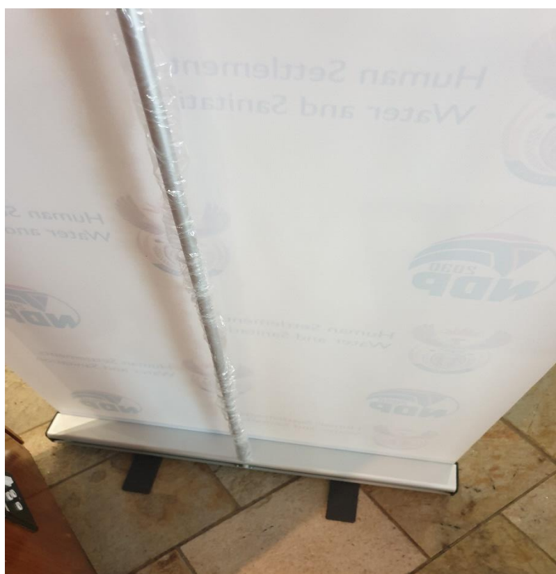
the back of the banner

These are easy to carry and light . Each bag must be labelled with the banners that are inside for easy access