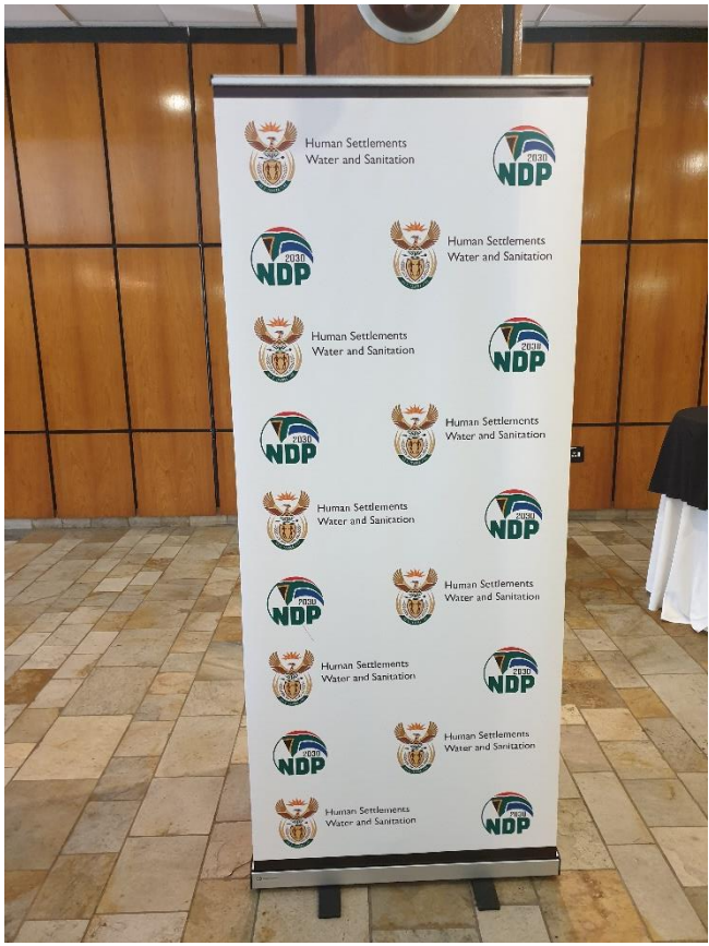
Normal size of the pull up banner with the exact frame as the one on the picture