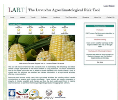
Figure 3: The LART decision support tool home web page.

The LART has two main components: climatological risk and forecasting crop yield. This will enable the user to obtain agroclimatological risks for different maize crop varieties for a planting window starting in October to January.