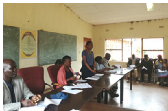
Figure 2: Meetings with stakeholders held by the study team in the Luvuvhu River catchment area.

the catchment. This was statistically significant (at 10% significance level) for the near-future and intermediate future climates, relative to the base period.