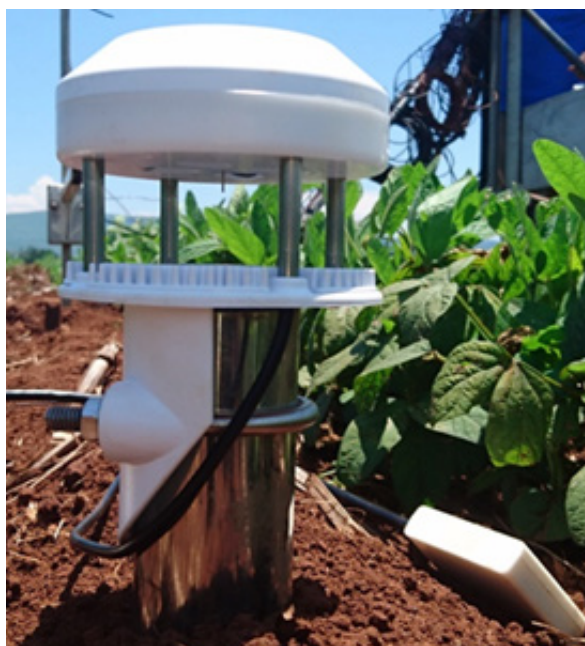
Line-wire thermocouples installed at canopy height.

Cultivar selection aims to reduce risks by avoiding, for example, drought periods during the most critical growing stages of the plant growth, such as flowering and seed set. Many factors need to be considered when selecting a cultivar for a particular location such as the target yield, intended purpose (e.g. biofuel production), expected planting date and season length, weather conditions likely to be experienced over the growing period and seed availability. The Biofuel Regulatory Framework noted that government will promote the use of drought-resistant cultivars.