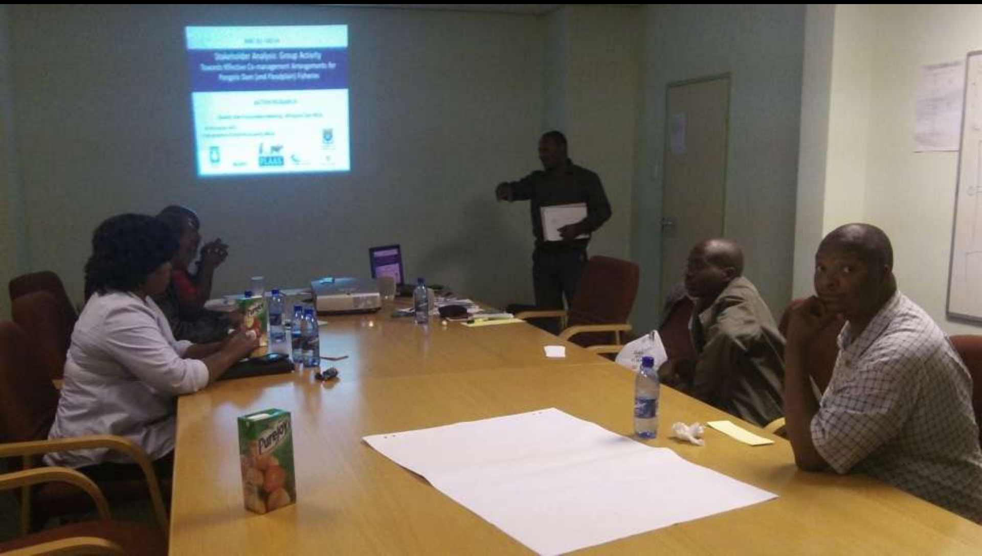
Event name, event date: Title of presentation, Author name, Institute for Poverty Land and Agrarian Studies