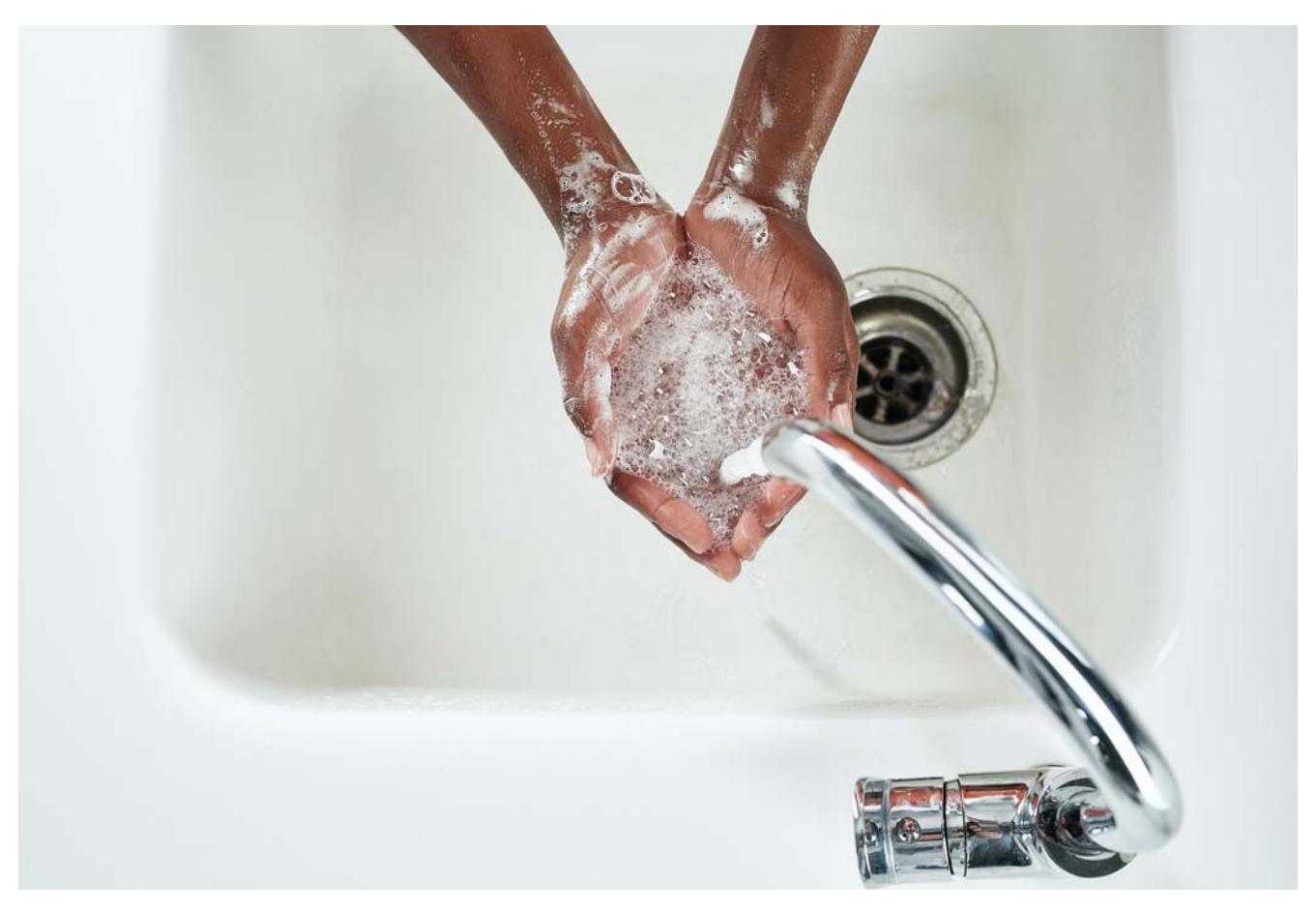
All the respondents indicated soap and running water were available in their workplace bathrooms.

concerned about how the responses to the research would affect the ability of the organisation to commence with work during the Covid restrictions."