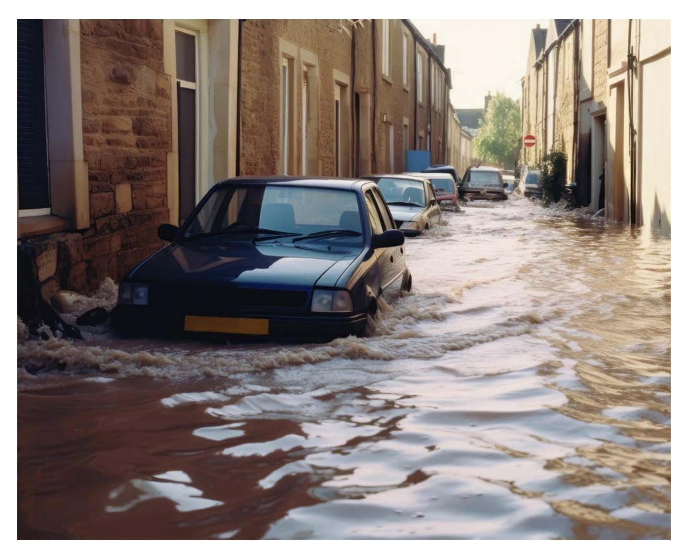
It is estimated that at least 12 000 people died in floods, wildfires, cyclones, storms, and landslides in 2023, 30% more than in 2022.

However, the water sectors in most countries are far from ready to be absorbing such a step up in investment, and generally has a limited capacity for converting funding into meaningful and