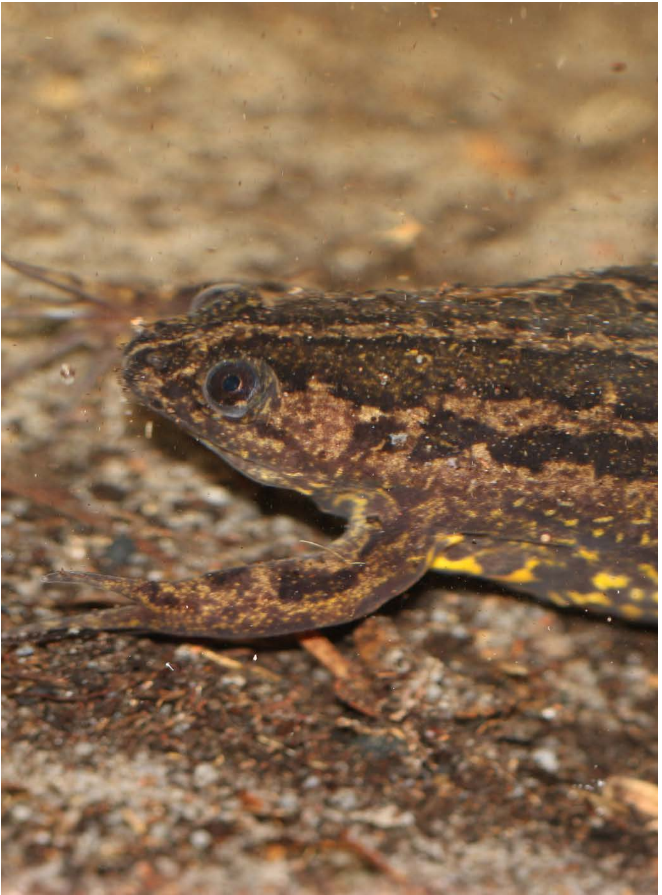
Cape Point was once considered the stronghold of the endangered Cape platanna, Xenopus gilli , but populations further afield have been found in recent decades. The species does not occur in Sirkelsvlei, preferring more acidic, seasonal pools.