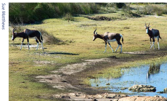
Bontebok would not have occurred naturally in the Greater Cape Town area, but were introduced to Cape Point in 1946 as part of the effort to save the subspecies from extinction

Sirkelsvlei had a considerably greater phytoplankton biomass than the other Cape Point vleis studied, with high chlorophyll c : a ratios indicating a large proportion of diatoms. Zooplankton were abundant, the community being dominated by the