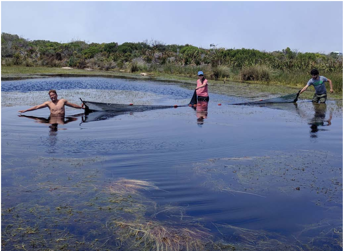
Seine-netting of artificial ponds containing hybrids of common and Cape platannas was conducted for many years to control the number of common platannas.

periodically flooded with seawater during high seas and spring tides. The lagoon is popular with seabirds as a roosting and bathing spot, according to Fraser, who also confirms Gardiner's ascertain that Sirkelsvlei is not attractive to birds.