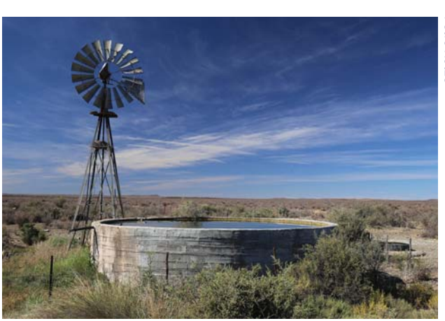
Raw water includes water extracted from water resources such as groundwater.

Dini too says he is comfortable stating that they broadly achieved their objectives. "It's a good lesson to learn for researchers," he says, in reference to the process they followed, and their results. According to the stipulations of the Terms of Reference for the four studies, for example, the final reports included proposed text that could be directly included in the draft strategy. The documents were written in formats more similar to pieces of policy advice than traditional academic outputs, Dini says. Feedback included that the work was very much client-focused, he says, which was extremely helpful to the officials on the receiving end. "If you put yourself in the mind of the people who have to work through the policy document, you can make it far easier for them, and put yourself in a much more powerful position," Dini says.