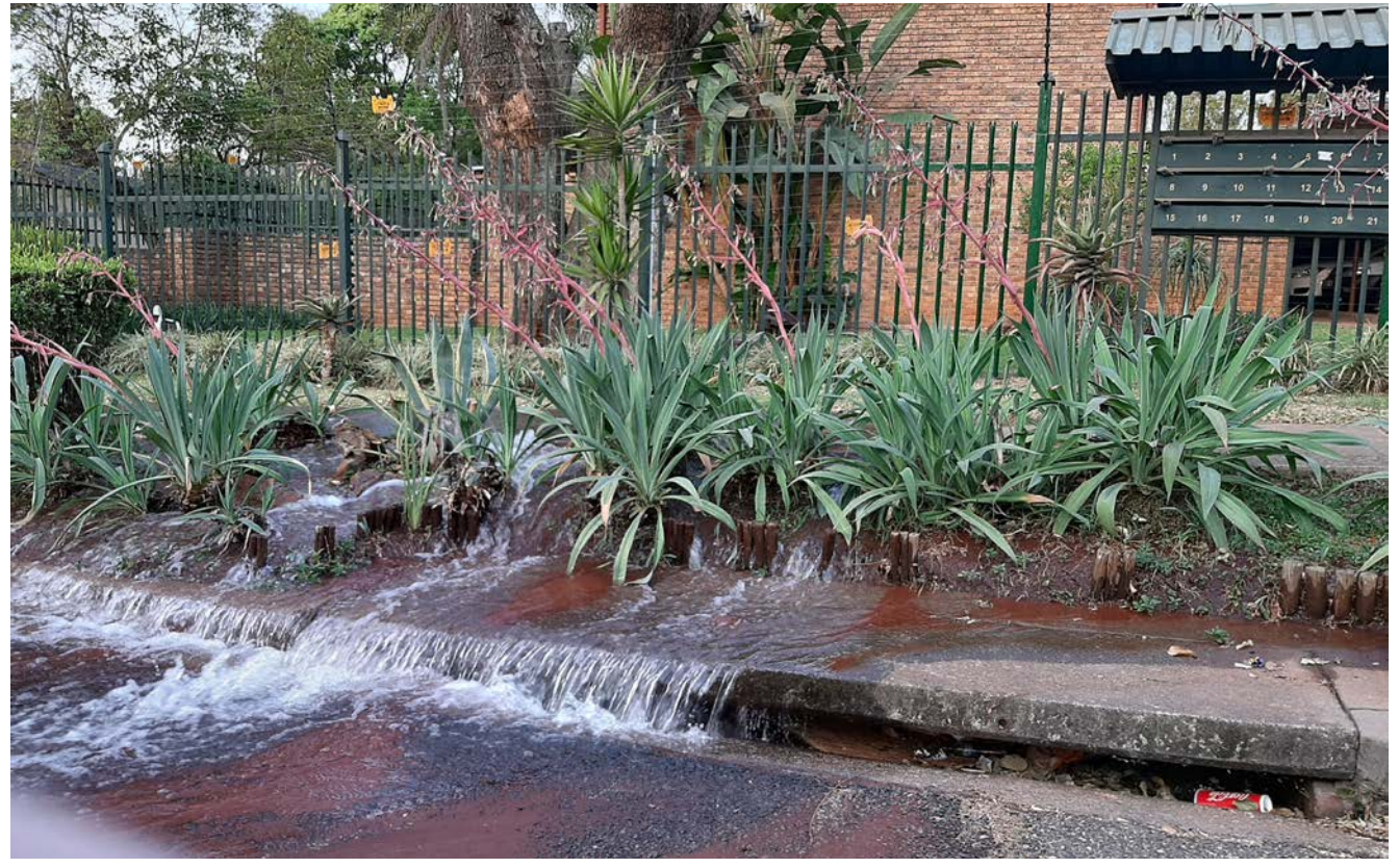
The latest available figures suggest that around 40% of municipal water is lost to leaks.

The company was approached by Thames Water, which serves some 10 million customers in London and surrounds, to help target leakage in a defined area. The FIDO AI algorithm analysed more than 35 000 sound files collected by acoustic loggers over the previous four months in just 2.5 hours, returning a report that Thames Water compared with its own leakage repair records and dig data. An analysis was then conducted on the entire logger estate of 27 000 devices so that Thames Water could decide whether to replace or maintain its existing loggers. Daily reports allowed Thames Water to identify 33 points of interest for followup, 11 of which led to the discovery of misaligned loggers and 20 correctly confirmed as leaks or not leaks (including four customer side leaks), representing an accuracy of over 92%. In its 2022/23