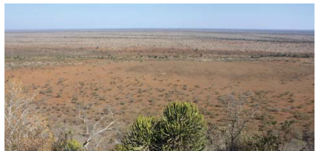
A view from Nkumbe lookout near Skukuza illustrates the lack of grazing currently being experienced in the Kruger National Park.

"If we do get to a situation of a La Niña, then we can expect significant flooding, and this is the forecast for mid-summer," notes Dr Riddell. "The Kruger National Park recognises that floods are also a natural part of the river system processes, and the ecosystem requires them in order to maintain that natural variability in the system by moving sediment and creating new habitats in the river system, for example. Nevertheless, if the rains are significant over the past two very dry years, we will be expecting significant sediment delivery into the rivers from upstream, as the catchments have been quite denuded. This is something we will be keeping an eye on."