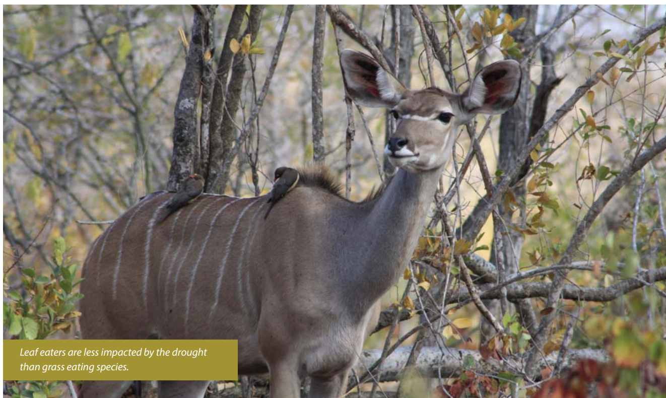
Leaf eaters are less impacted by the drought than grass eating species.