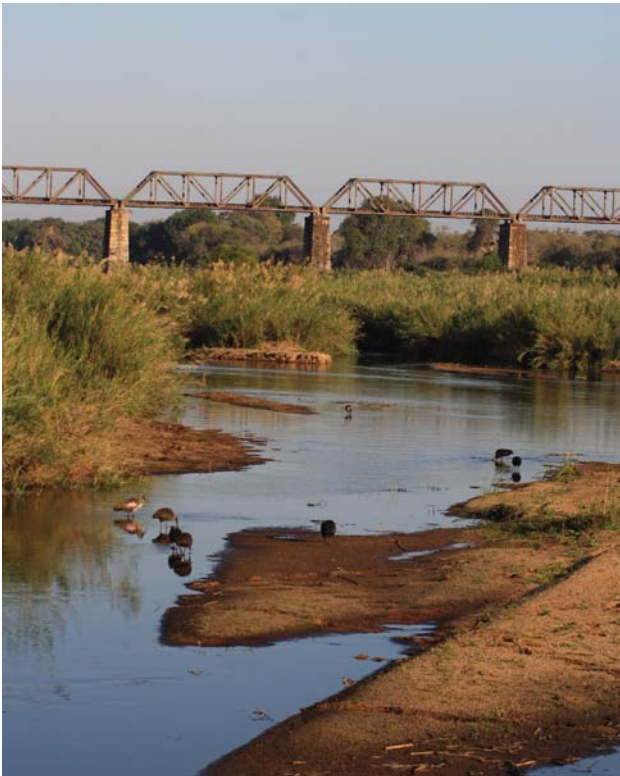
The park has a good working relationship with its upstream neighbours, which means that even during dry times, water is being let through to serve the Kruger National Park at the bottom end of the river catchments.