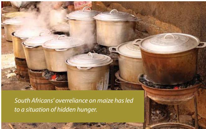
South Africans' overreliance on maize has led to a situation of hidden hunger.