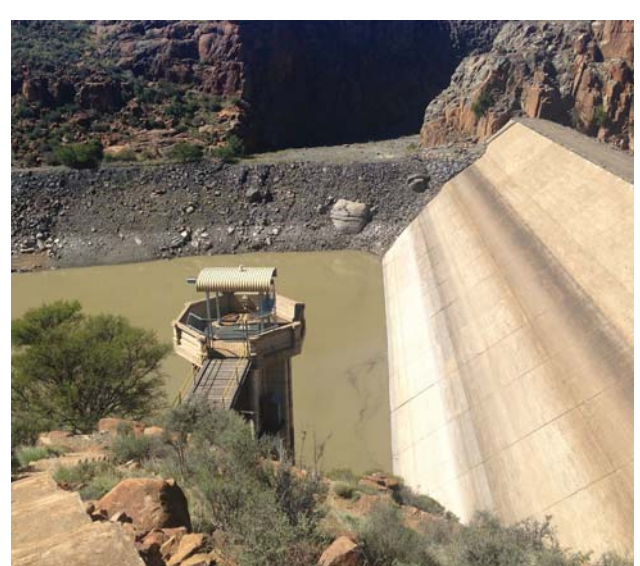
Reusing water treated with advanced technology can free up limited freshwater supplies in dams and rivers for direct human use.

These dissolved organic constituents include low concentrations of a wide range of organic chemicals from industrial and domestic sources (micro-pollutants). Examples include pharmaceuticals and personal care products pesticides, preservatives, surfactants, flame retardants, disinfection byproducts and chemicals released by humans such as dietary compounds and steroidal hormones.