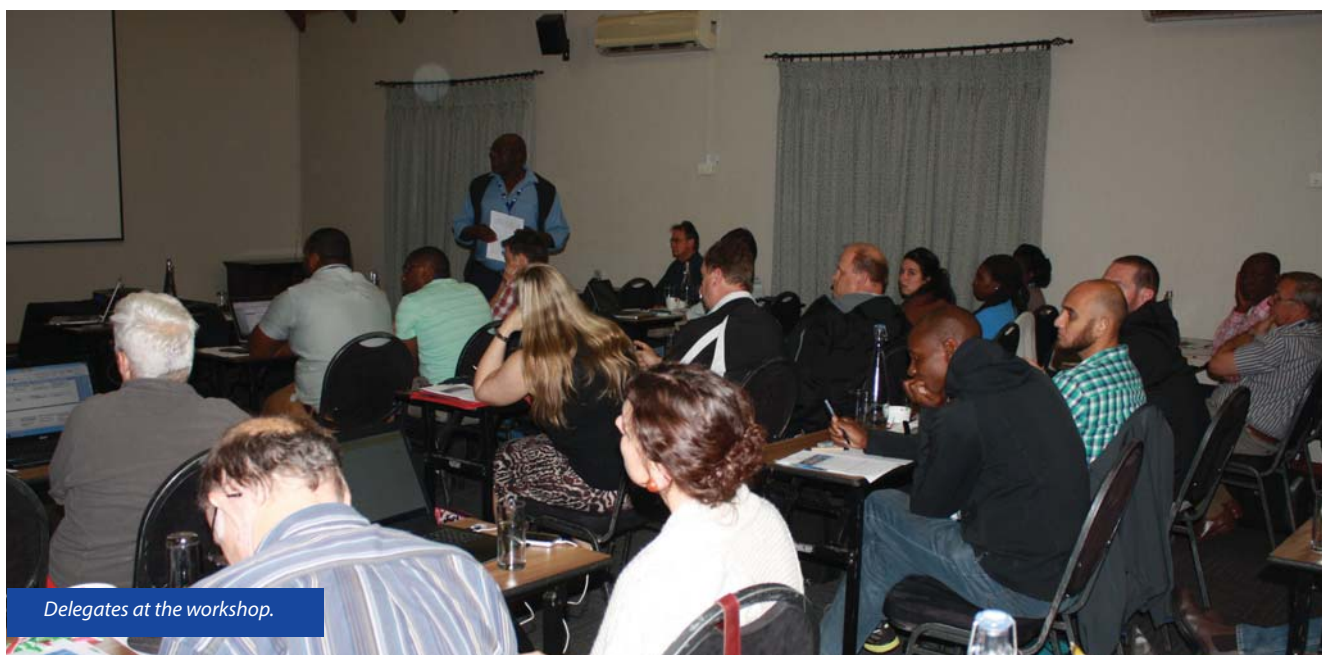
Delegates at the workshop.