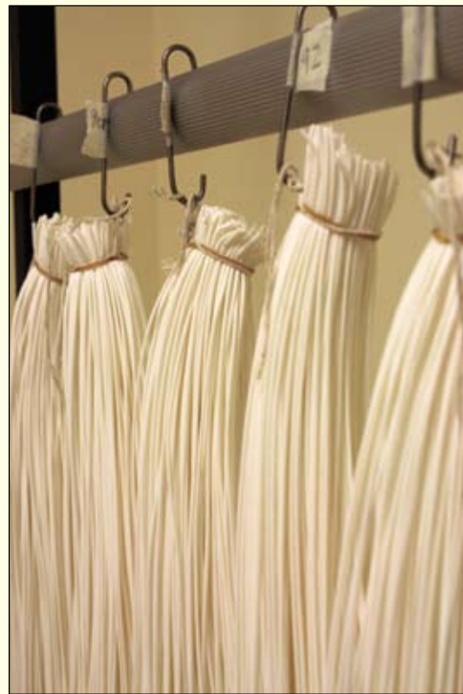
The cut capillaries being hung out to dry.