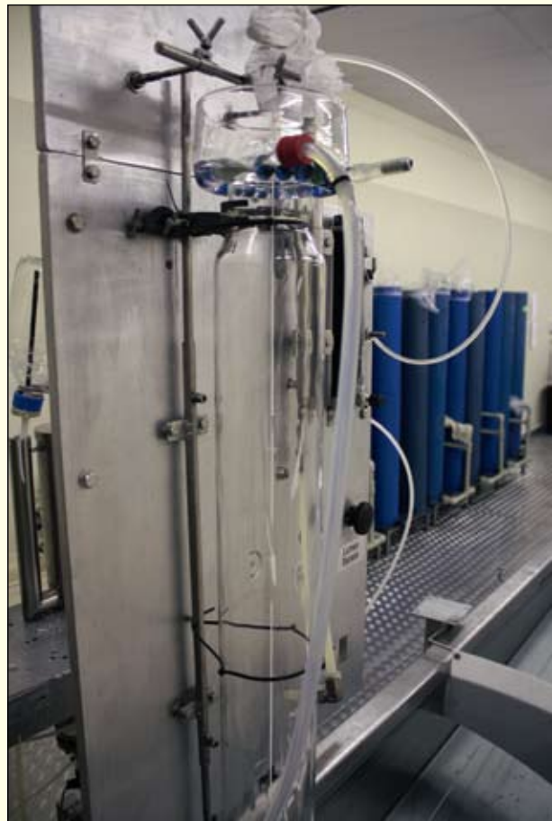
The capillary membranes are produced through a process of diffusion-induced phase separation.