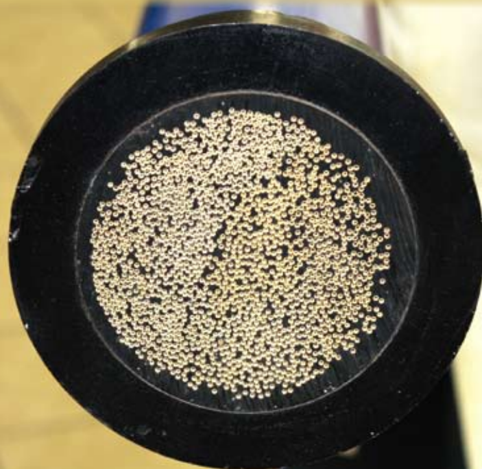
The completed module. There are about 5 000 capillary membranes in a single module.

South Africa's first capillary ultrafiltration manufacturing plant has opened its doors in Somerset West, in the Western Cape. Lani van Vuuren paid a visit.