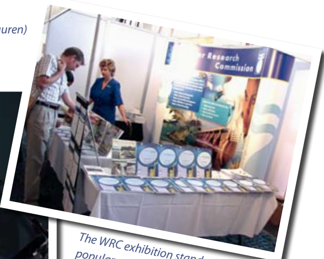
The WRC exhibition stand proved to be popular.