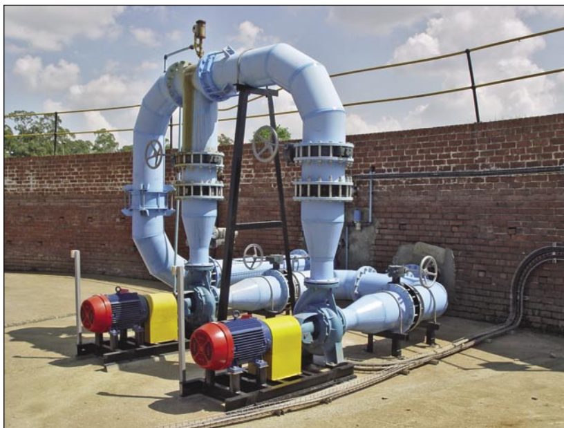
The final water pump station.