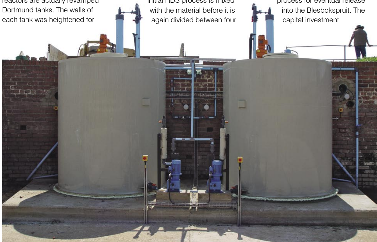
The polymer dosing station.

From here the material is pumped to Ancor's biofilters for removal of remaining Chemical Oxygen Demand (COD) and ammonia following the conventional sewage treatment process for eventual release into the Blesbokspruit. The capital investment